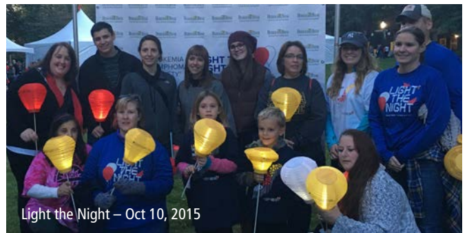
Light the Night – Oct 10, 2015