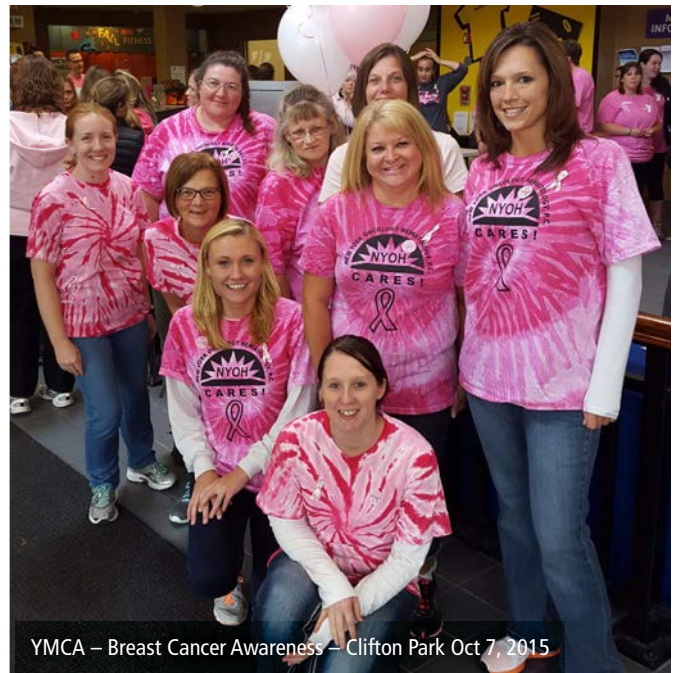
YMCA – Breast Cancer Awareness – Clifton Park Oct 7, 2015

Leading up to the Making Strides Walk, staff across the practice sites contributed to gift baskets to raffle off, raising $864 for the NYOH Community Cancer Foundation. Thank you to everyone who walked, donated support and contributed to the gift baskets.