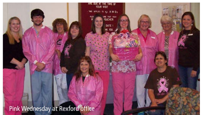
Pink Wednesday at Rexford office