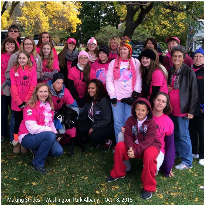
Making Strides – Washington Park Albany – Oct 18, 2015