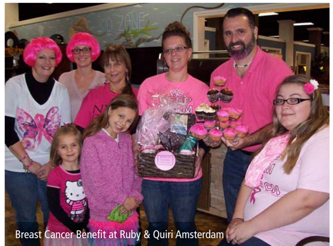
Breast Cancer Benefit at Ruby & Quiri Amsterdam